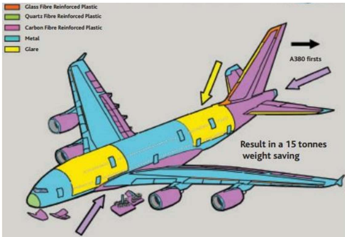
Figure: Airbus 380 material composition.

Carbon fiber-reinforced polymers (CFRPs) and other advanced composites are essential technologies in the aerospace industry. These materials are perfect for a variety of aerospace applications because of their outstanding strength-to-weight ratios.