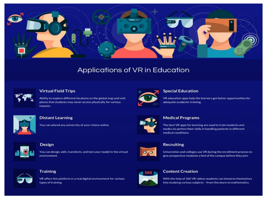
Figure: Applications of VR in education (Source:) VR in education offers a number of advantages, but it also has drawbacks. The expensive price of hardware VR and software, which might be unaffordable for many educational institutions, is one of the primary obstacles. In addition, there are technological difficulties in setting up maintaining and VR teachers systems and must have specific

possible. Furthermore, because students may collaborate in virtual settings regardless of where they are physically located, VR can support collaborative learning. Important social and collaborative abilities may be developed in this way. Additionally, VR may offer invaluable real-world experience in professions where having hands-on experience is crucial, such as architecture, engineering, and medicine.